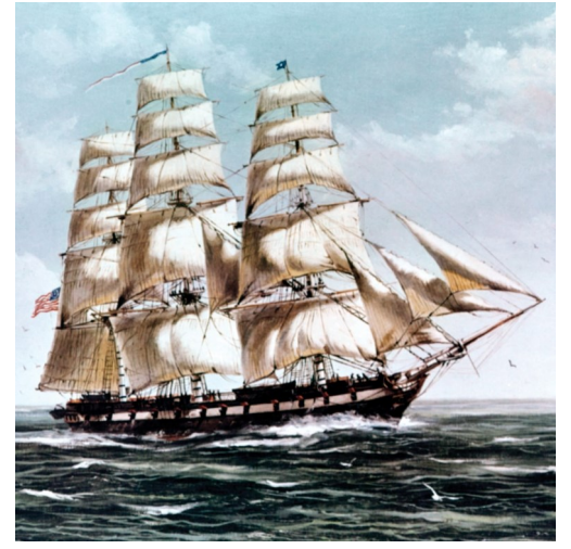
Sloop-of-War USS Constellation

The USS Constellation is a sloop-of -war (a warship with a single gun deck), the last sail-only warship designed and built by the United States Navy. She was built in 1854, using material salvaged from the frigate Constellation, one of the Navy's original six ships, which had been disassembled the year before.