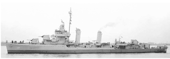
USS Emmons (DD457-DMS22)