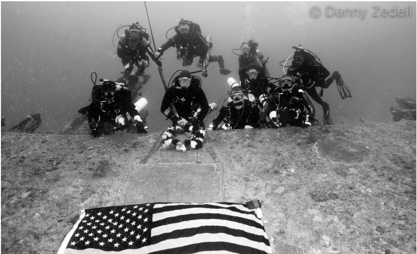
Participants in this year's USS Emmons Memorial Dive pause for pictures at the Emmons site. (story, page 2).