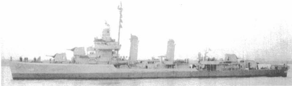
USS EMMOMS (DD457 / DMS22)

Phone: (610) 417-5163 E-mail: ussemmons@gmail.com