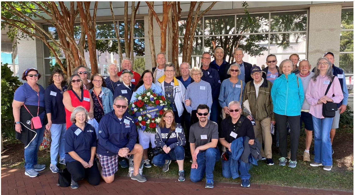
Some take a photo break during the Emmons reunion's U.S. Naval Academy tour (see story, page 1).

JOIN OUR FACEBOOK GROUP USS EMMONS REUNION