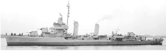
USS Emmons (DD457-DMS22)